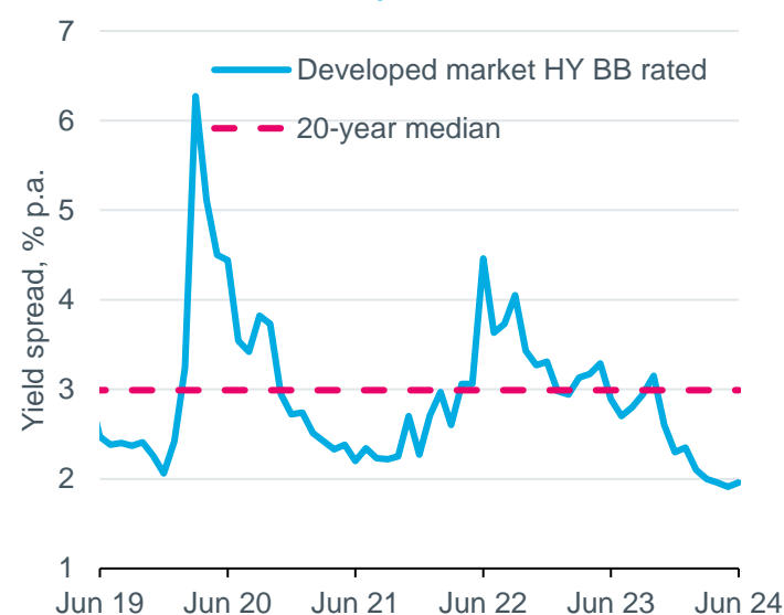
Chart of the month – The spreads on HY bonds are historically low

The chart shows the additional yield, or spread, received on high-yield bonds on top of the government bond yield.